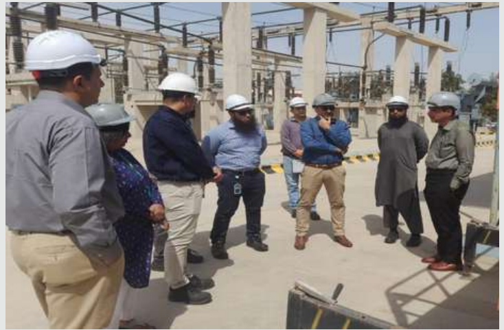
Management Safety Audit conducted by CGTO at Gulshan Grid