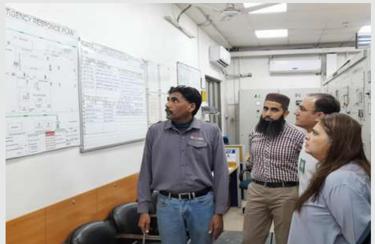
Management Safety Audit conducted by CMCO at Gizri Grid Station